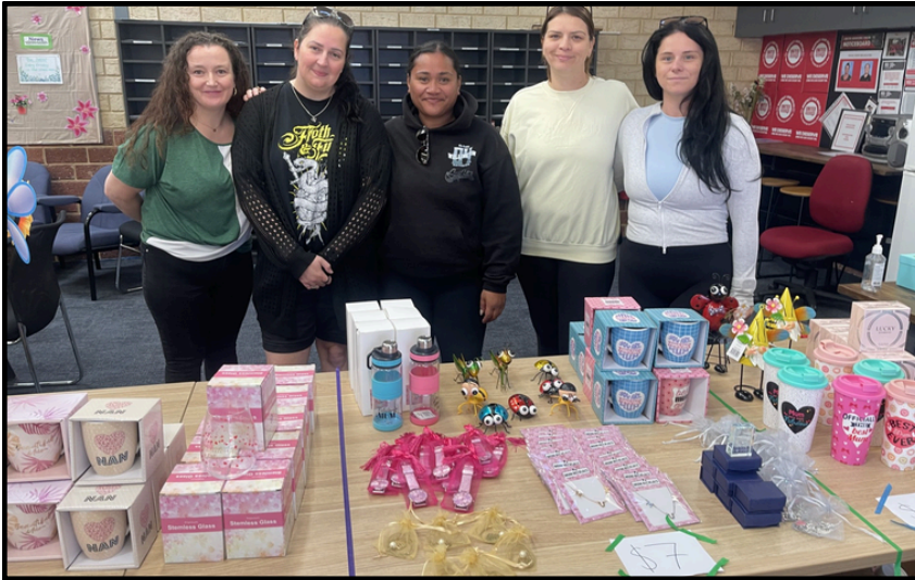
Merriwa Education Support Centre